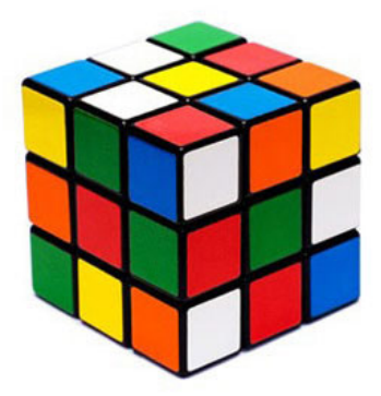
1980s: e.g. Innovation